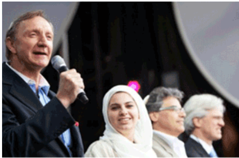
Religious leaders at the National Mall.

Earth Day Network reached out to the religious community this Earth Day by bringing attention to our environmental message. The opening of our Earth Day 2008 event in Washington, DC featured a religious convocation with leaders from the Christian, Muslim, and Jewish faiths.