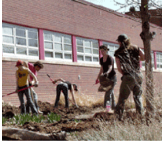
Volunteers green school in Denver

Also during Earth Week, Earth Day Network's staff was hard at work on school greening projects in Denver, Chicago and New York, co-produced by Green Apple Festival and sponsored by Chase. At Denver's Ellis Elementary , volunteers created an outdoor classroom with a garden of native species, monitored water and air quality, and addressed energy efficiency and waste in the cafeteria. Earth Day Network installed an 8-panel solar energy system that will save the school $48,000 over the next 30 years. In Chicago , students at Percy Julian High School held an "Earth Fair" with displays including solar panels that the school will be installing, organic fruits and part of a green roof that Earth Day Network hopes to place on the school building. In New York , students at Merrick Academy were greeted by a new "living wall" made of plants that filter air and water, and students helped paint an eco-mural using "green" paint. Some 3,000 students and faculty were exposed to key environmental issues through these events. Green schools will help improve students' well-being and academic performance, while reducing the impact on the